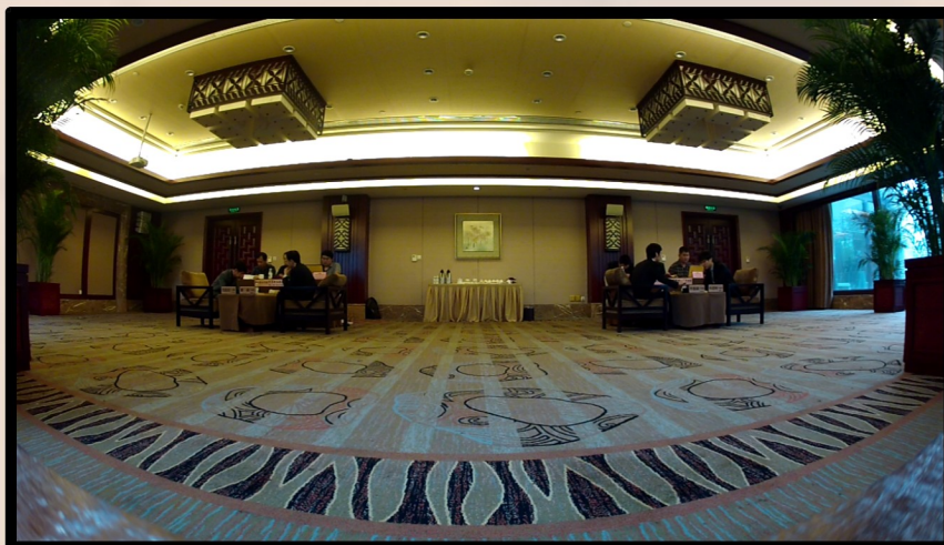
Right: The Ing Cup semi-finals in Chengdu, Sichuan Province.