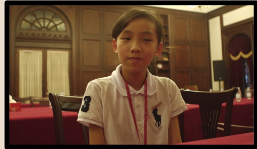
Above: 11-year-old Shanghai female champion describes the pressures of competition.

Fundamentally, we want “The Surrounding Game” to bear out the curiosity, the addiction, the reverence, the frustration, and the joy that Go inspires.